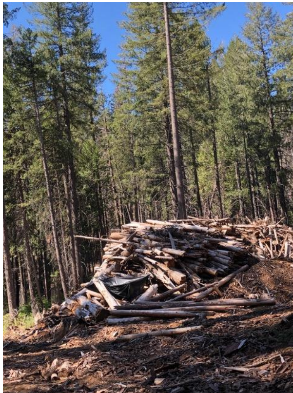
Figure 2: Burn pile on the Stanislaus National Forest.

CAL FIRE, as well as multiple private contractors, will be continuing to implement prescribed fires that are critical for community protection throughout the spring burn season. These fire practitioners are developing new protocols to ensure public and community safety that could be adapted for Forest Service burns. For example, workers on fire projects can be protected by wearing N95 masks or more advanced smoke protection gear and maintaining social distance, which is generally the case during planned fires.